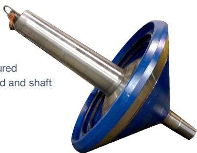
Remanufactured Symons Head and shaft

NCIndustrial stocks parts for most crushers on the market. Save money on all your steel and bronze parts. Call today and ask for a quote. Used parts and equipment are also available upon request. We are always ready to assist you in your hunt for the best quality used crusher part available.